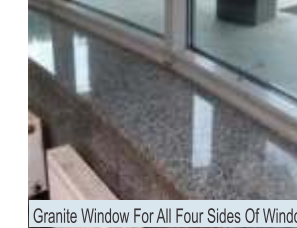
Granite Window For All Four Sides Of Window