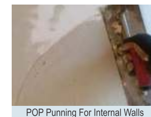
POP Punning For Internal Walls