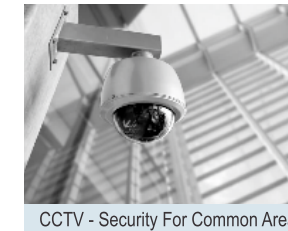
CCTV - Security For Common Area