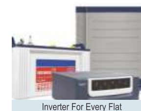
Inverter For Every Flat