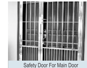
Safety Door For Main Door