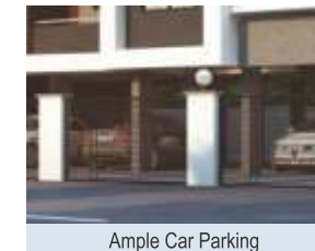
Ample Car Parking