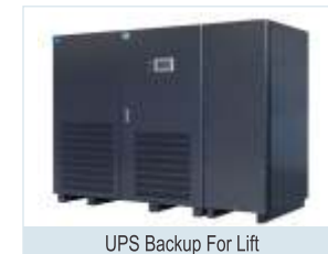
UPS Backup For Lift