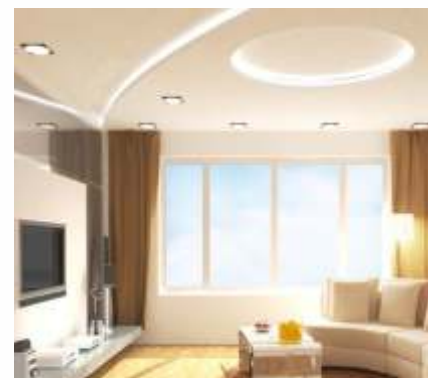
False ceiling for Living Room