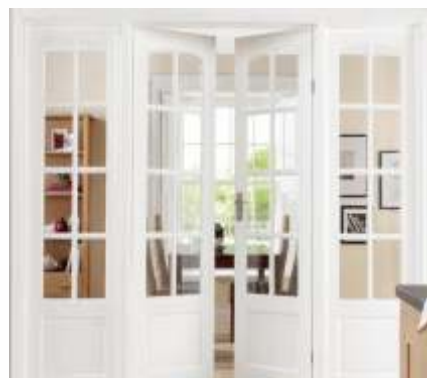
SFD - French door for balcony opening