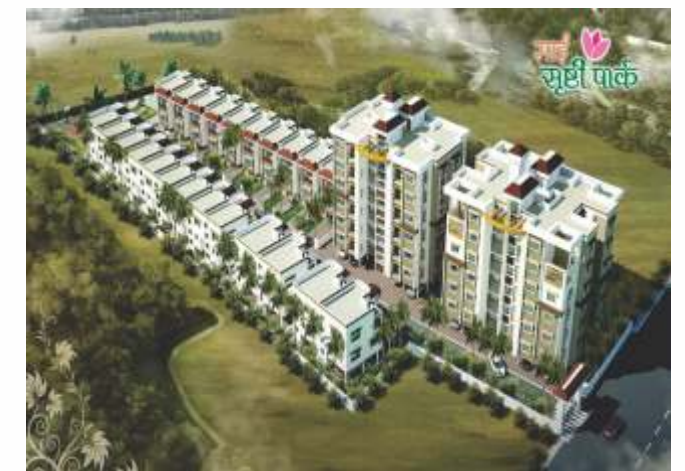
Sai Shrushti Park Golwadi