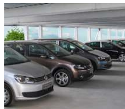
Allotted Car Parking