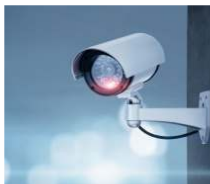
CCTV – Security for common areas