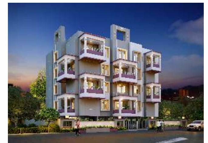
Adinath Paradise Garkheda