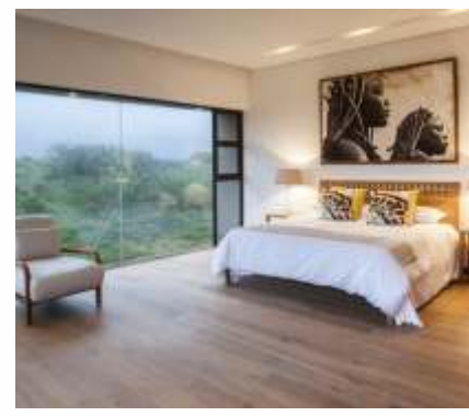
Wooden flooring in Master Bedroom