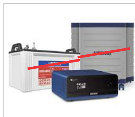
Inverter for every flat