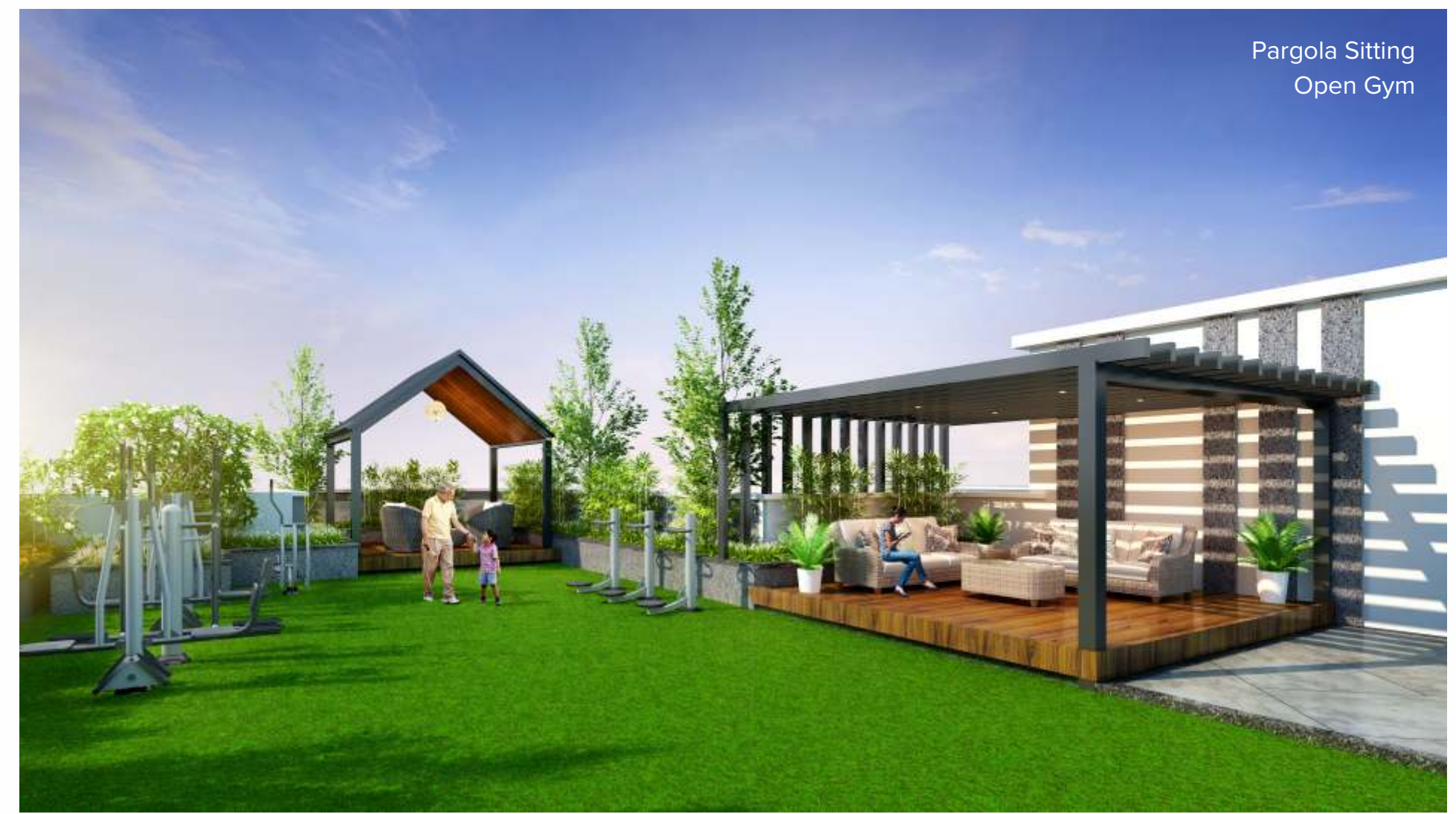
Pargola Sitting Open Gym