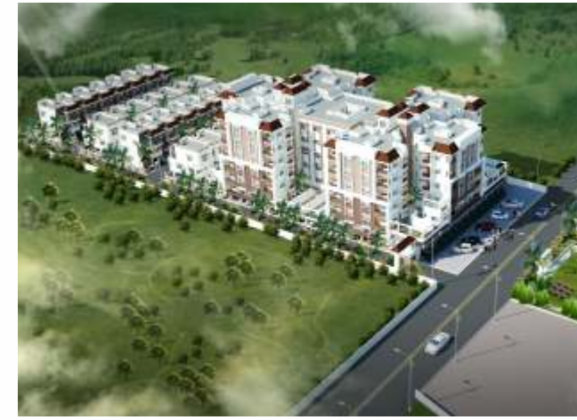
Sai Sanket Park Near Bembde Hospital