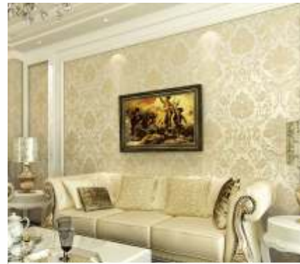
Wall Paper for Living & Master Bedroom for one wall