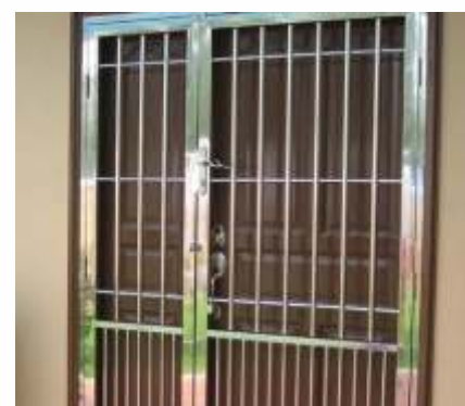
SS Safety Door for Main Door