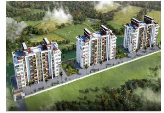
Sai Nakshtra Nakshatrawadi