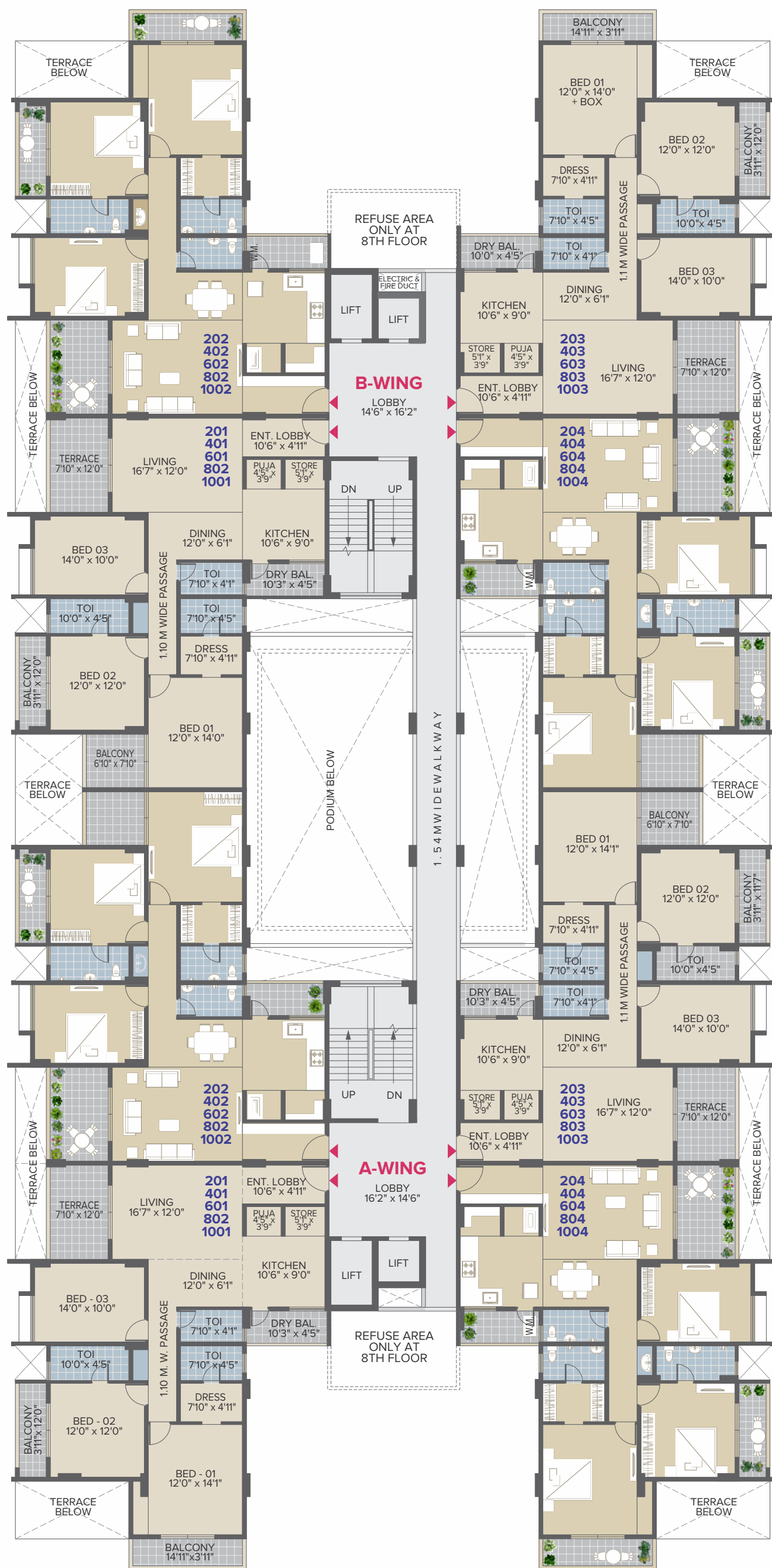
TYPICAL 2ND, 4TH, 6TH, 8TH & 10TH FLOOR PLAN