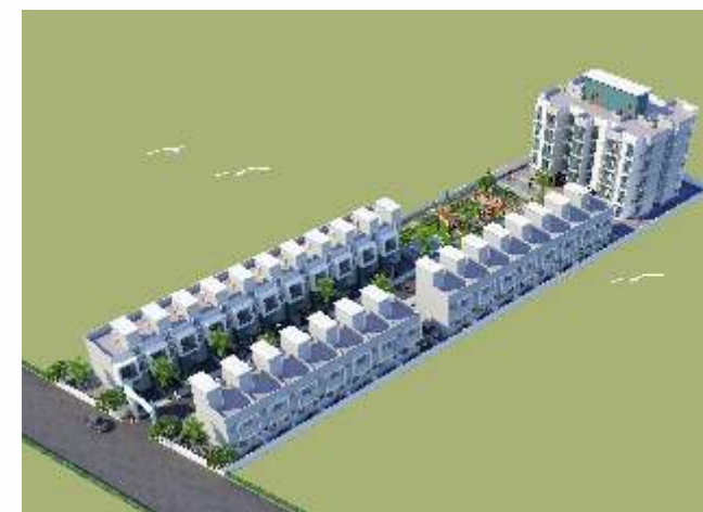
Chintamani Hill View Deolai