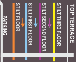
FLOOR SECTION PLAN