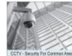
CCTV - Security For Common Area