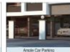
Ample Car Parking