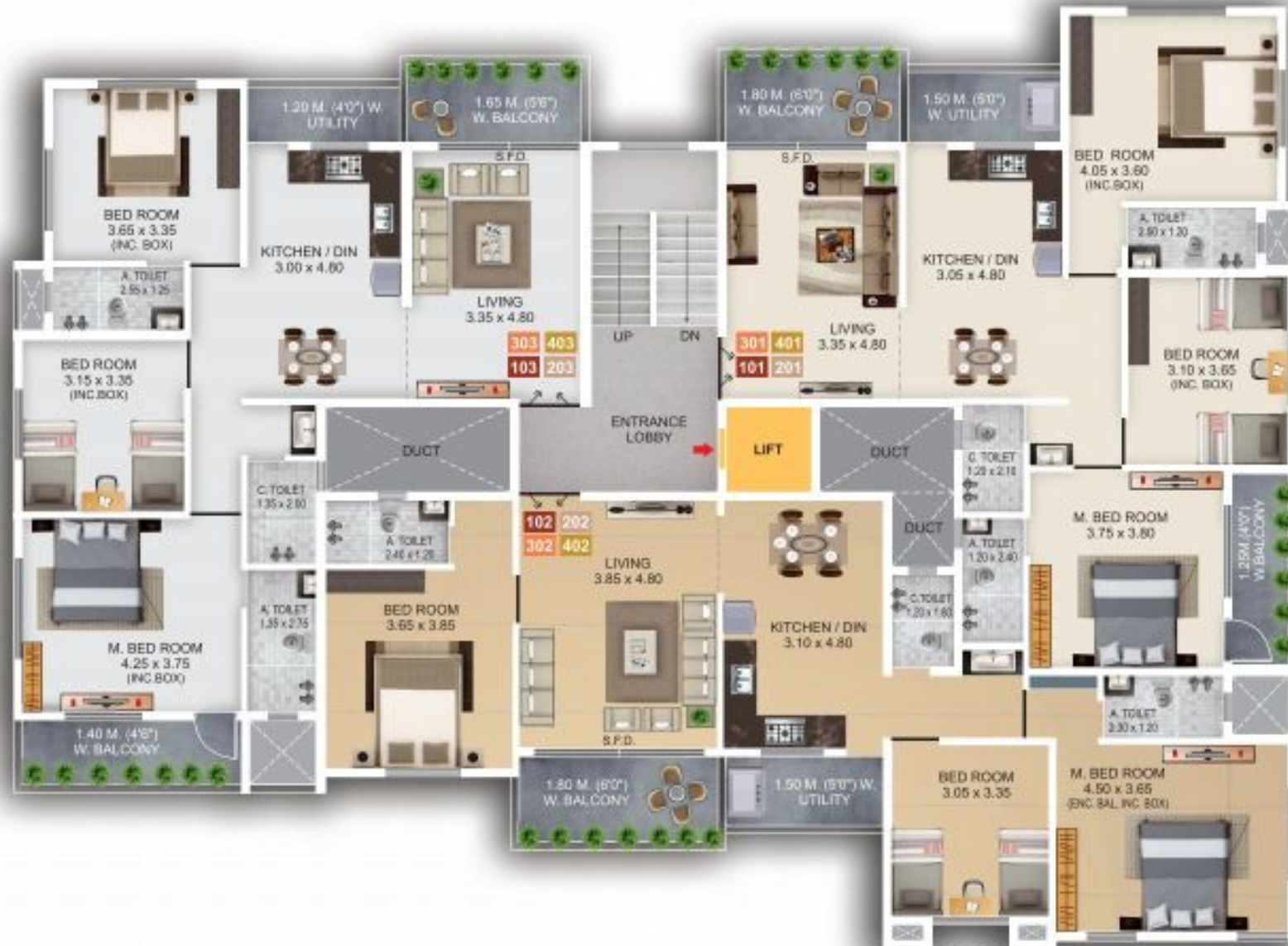
TYPICAL FIRST, SECOND, THIRD & FOURTH FLOOR PLAN