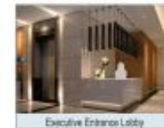
Executive Entrance Lobby