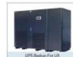
UPS Backup For Lift