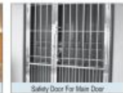
Safety Door For Main Door