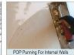
POP Running For Internal Walls