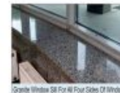
Granite Window Sill For All Four Sides Of Window