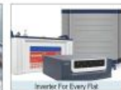
Inverter For Every Flat